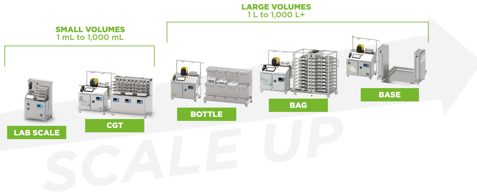
Figure 3: Unlimited scalability for aseptic filling from laboratory to commercial production

One big challenge is scaling fluid management according to manufacturing needs. The RoSS.FILL system opens doors to scale-up or scale-out in terms of both number of bags and size of bags. For example, it can fill 100 single-use bags at 50 mL each or 20 single-use bags at 20 L each per module, making it suitable for small volumes of cell therapies, viral vectors, mAbs, and other early-phase studies as well as for commercialized bulk drug substance. It is even possible to attach one or more additional filling modules to the control unit, which allows operators to aliquot and filter 400 L or more of drug substance in one batch run.