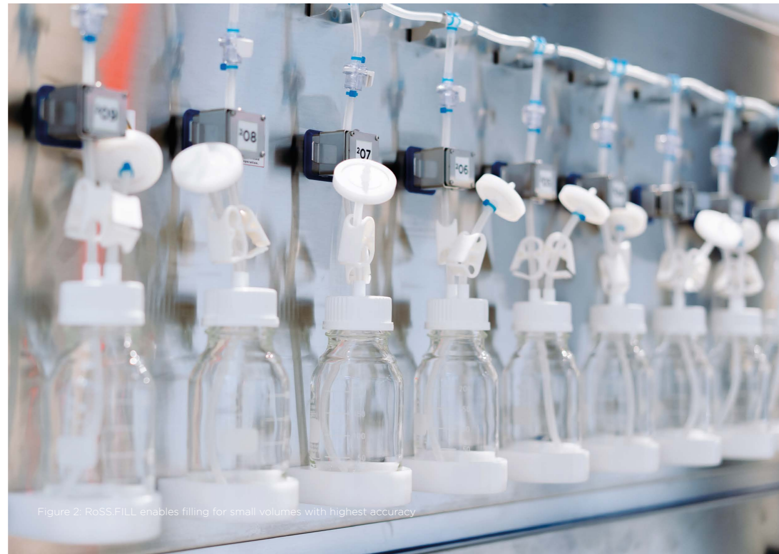
Figure 2: RoSS.FILL enables filling for small volumes with highest accuracy

The unprecedented accuracy with which low-volume single-use systems can be filled gives operators better control.