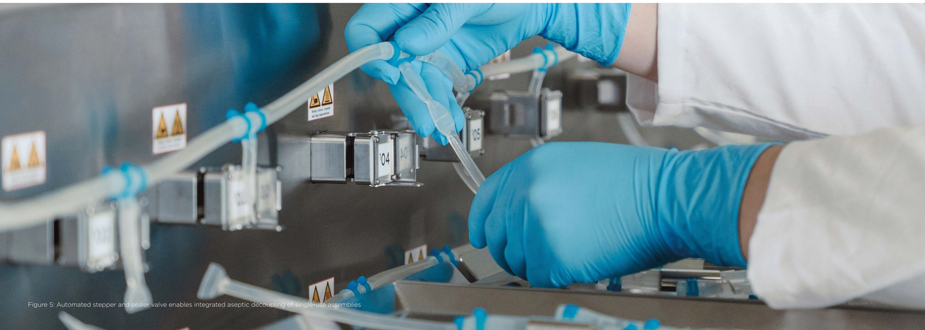
Figure 5: Automated stepper and sealer valve enables integrated aseptic decoupling of single-use assemblies

A case study of a biopharmaceutical manufacturer producing live-attenuated vaccines demonstrated that automated filling is up to 70 % faster than manual handling when filling bottles of varying sizes. The case study looked not only at actual filling duration, but also at preparation and documentation, which is not required when filling with automated systems meeting 21 CFR Part 11-relevant standards.