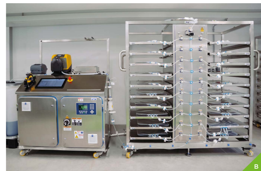
Figure 4: Modularity enables hybrid filling with (A) RoSS.FILL Bottle and (B) RoSS.FILL Bag